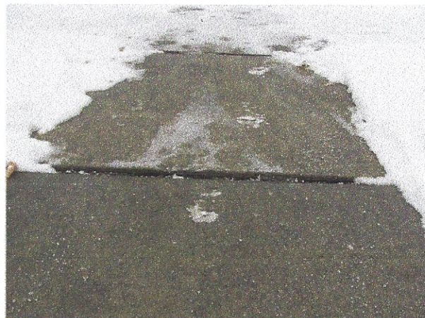
Minor sidewalk settlement evident