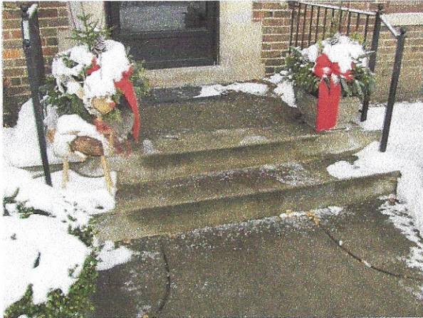
Concrete stoop with steel railings

Condition: The concrete is in good to fair overall condition with limited cracks and spalls evident. The masonry is in fair overall condition with many locations of brick and mortar deterioration, and efflorescence evident.