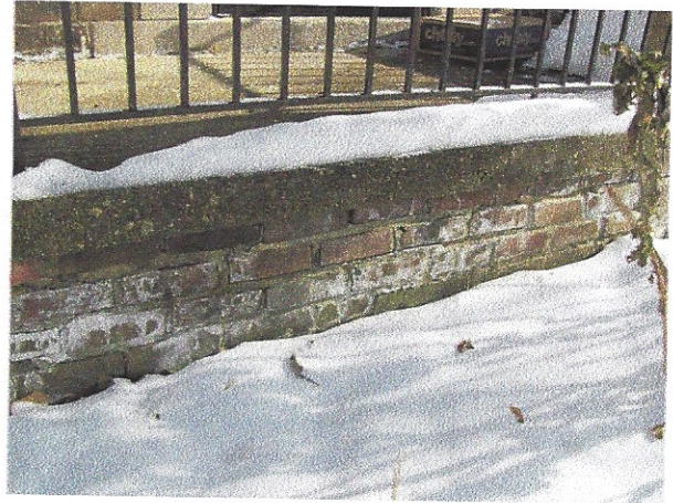
Efflorescence at masonry