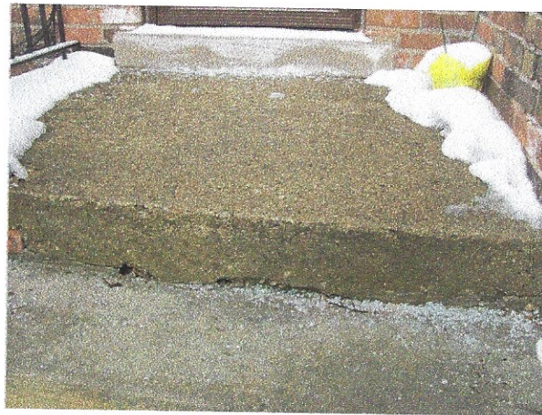
Concrete cracks and spalls

Useful Life: Up to 65 years although interim deterioration of areas is common. The Association should also anticipate more frequent repairs to the masonry, or up to every five years in coordination with concrete activities.