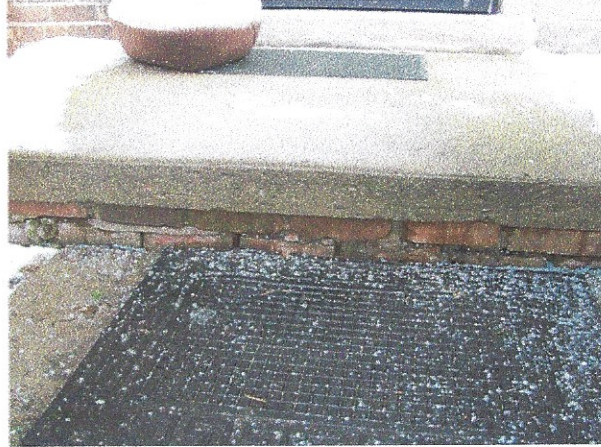
Brick and mortar deterioration at stoop