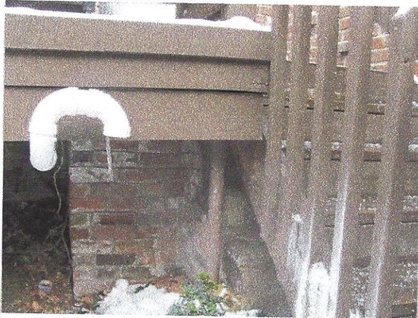
Example of original stoop under wood deck