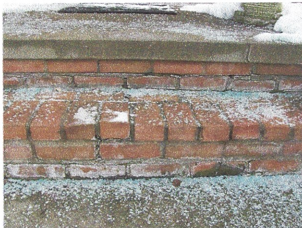
Mortar cracks and deterioration