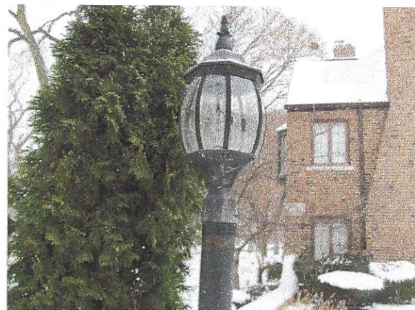
Rust at pole