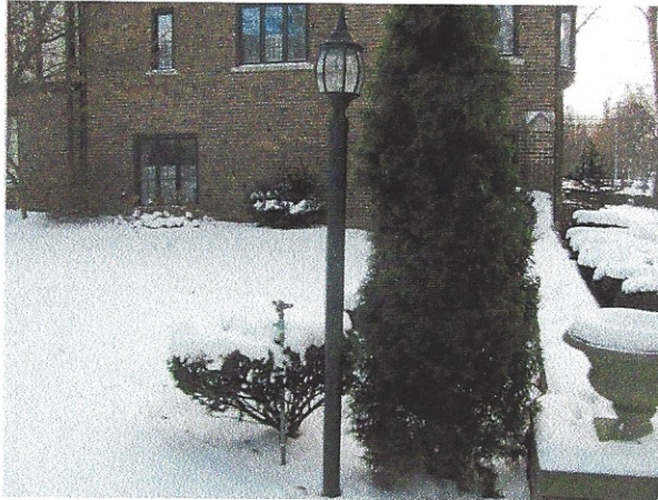
Light pole and fixture