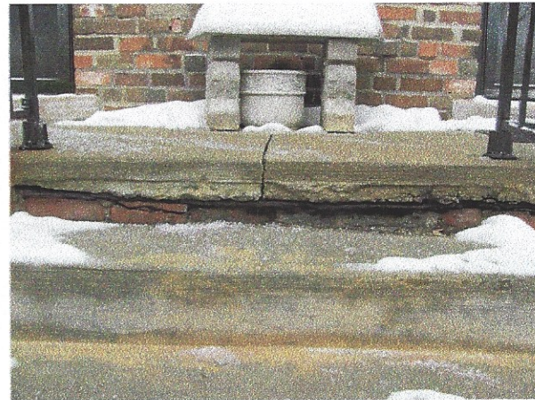
Concrete and masonry deterioration at shared rear stoop